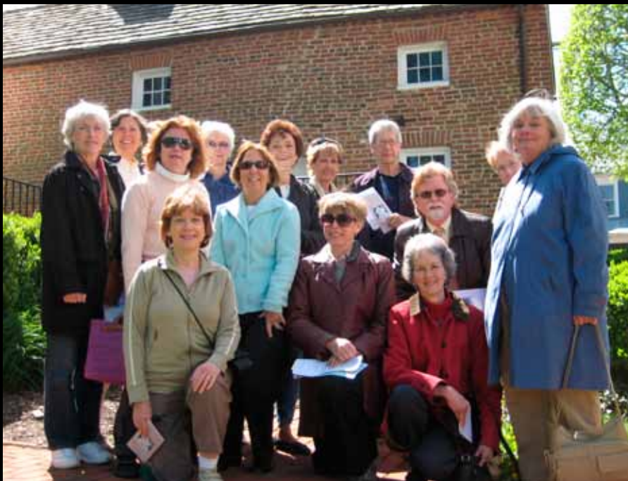
Historic Fairfax City Tour

This spring, for the first time, branch members who wish to renew by credit card may do so online. All who renew online receive an immediate confirmation email, which is also sent to the